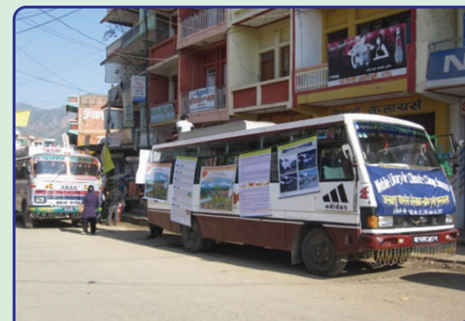
Mobile Library, 2010