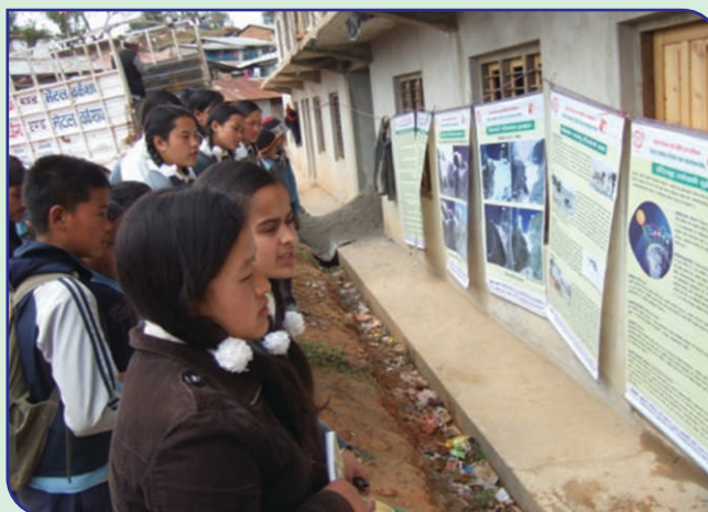
Students Observing Posters Containing Climate Change Information, 2013

Technology (NAST) and the Ministry of Science, Technology and Environment (MoSTE) under the expanded process of National Adaptation Program of Action (NAPA) in Nepal (2008-2010), which was supported by DANIDA, UK DFID, GEF and UNDP Nepal. On July 2011, Climate and Development Knowledge Network (CDKN), a UK based organization supported NCKMC to strengthen and incorporate the envisaged objectives of NCKMC for a year.