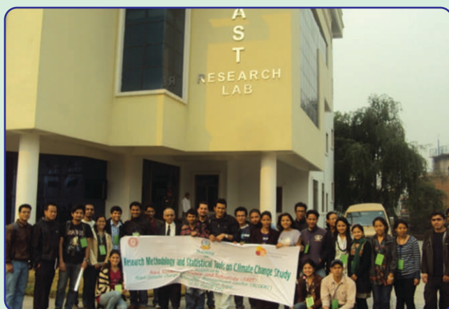
Climate Change Research Training, 2012